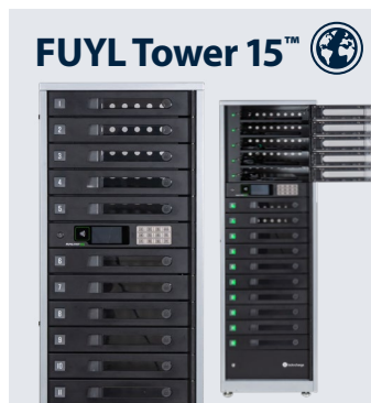
Intelligent management system that charges, stores, secures and manages assets for most mobile devices in 15 individually lockable compartments.