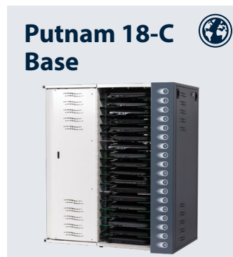
Compact, stackable station with small footprint that fits Chromebooks, small laptops and tablets.