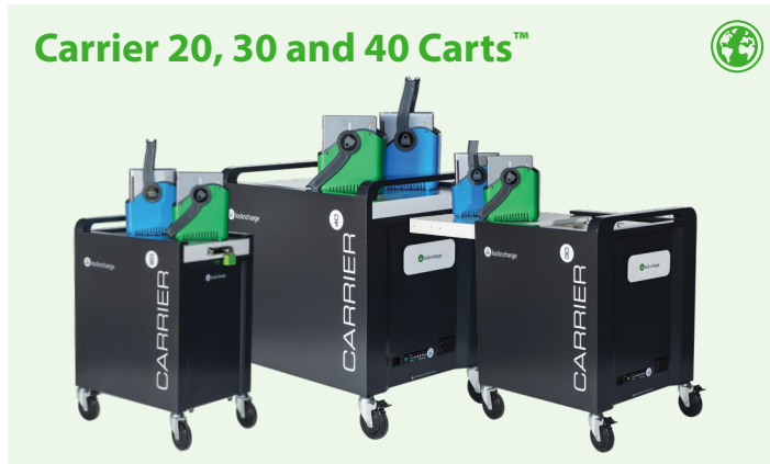
Our highest quality Carrier Carts include Large Baskets by LocknCharge for easy device distribution and portability.