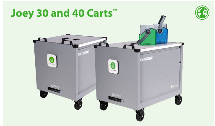
Innovation meets affordability with this small-footprint Cart. Enjoy LocknCharge Cart features – including Baskets by LocknCharge – at an entry-level price.