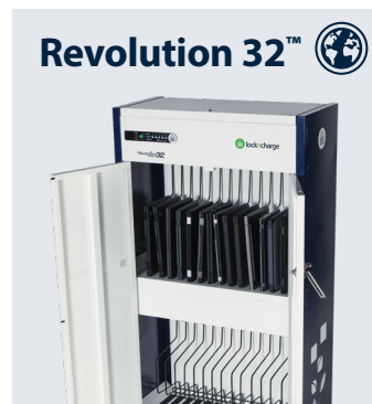
Stationary charging cabinet with a small footprint that holds 32 of almost any device.