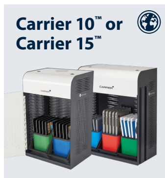
Includes Large Baskets by LocknCharge and a stainless steel rack to accommodate larger devices.