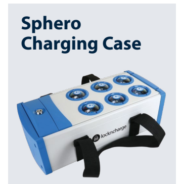
Charging case designed to charge, store, secure and carry Sphero robots, maze tape and protractors.