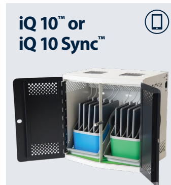
Includes two Small Baskets by LocknCharge for easy iPad and tablet portability and distribution.