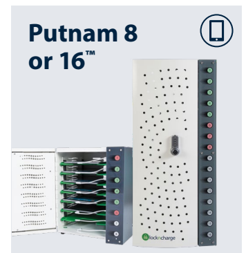
Compact station features color-coded external LED lights to know charging status of devices. Includes MFi cables.